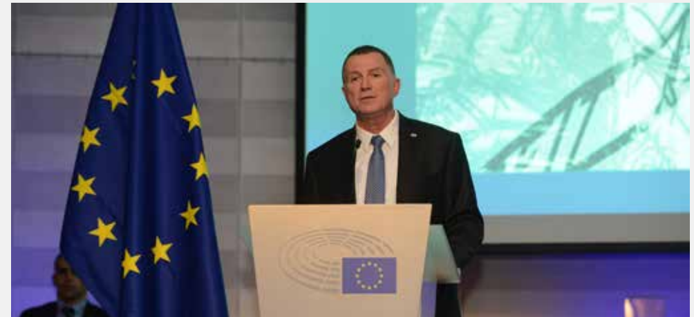
Yuli-Yoel Edelstein Speaker of the Knesset