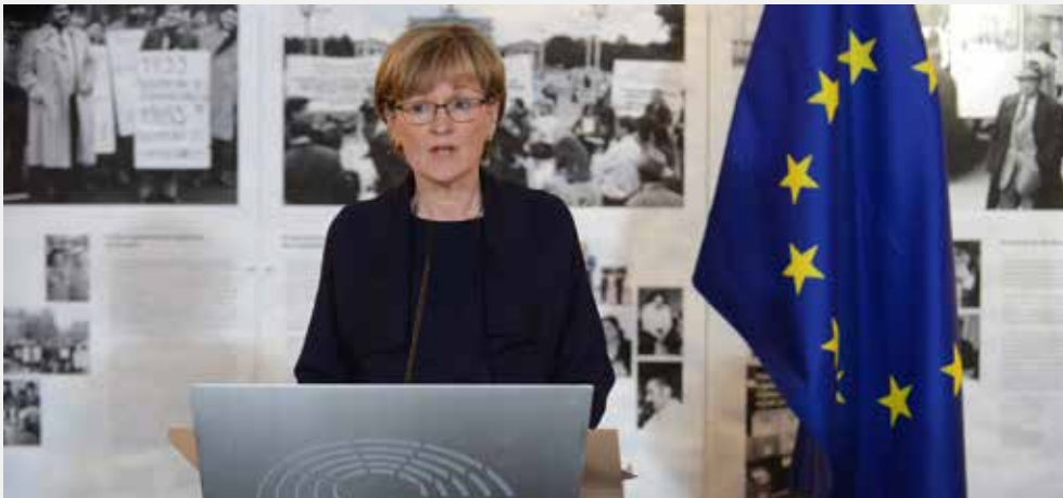
Mairead McGuinness Vice-President of the European Parliament